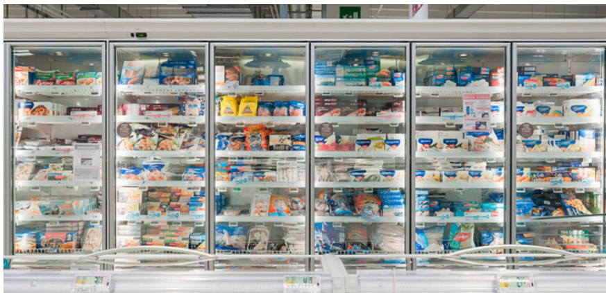
Vertical High High Volume Remote Reach In Freezer